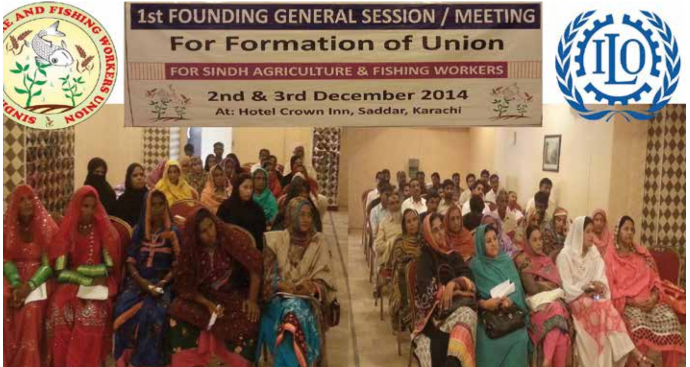
First agriculture and fishing workers' trade union in Pakistan registered in Karachi

Sindh has become the first province to recognise women and men in the agriculture and fishery sector as workers under law and has registered the first ever trade union for this sector. The Sindh Agriculture and Fishing Workers Union (SAF-WU) was registered yesterday with the office of the Registrar Trade Unions, Karachi under the provisions of Sindh Industrial Relations Act, 2013. The union currently has 400 members of which 180 are women, all belonging to various districts of Sindh.